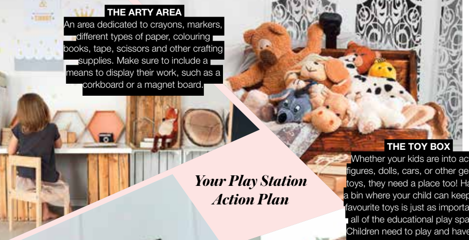
THE ARTY AREA An area dedicated to crayons, markers, different types of paper, colouring books, tape, scissors and other crafting supplies. Make sure to include a means to display their work, such as a corkboard or a magnet board.