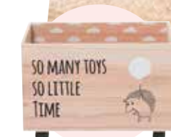
TINY TIDIER Mini Collection toy storage box with wheels, Dh575, The Bowery Company