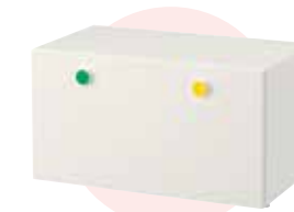
SIT AND STOW Storage bench, Dh300, Ikea