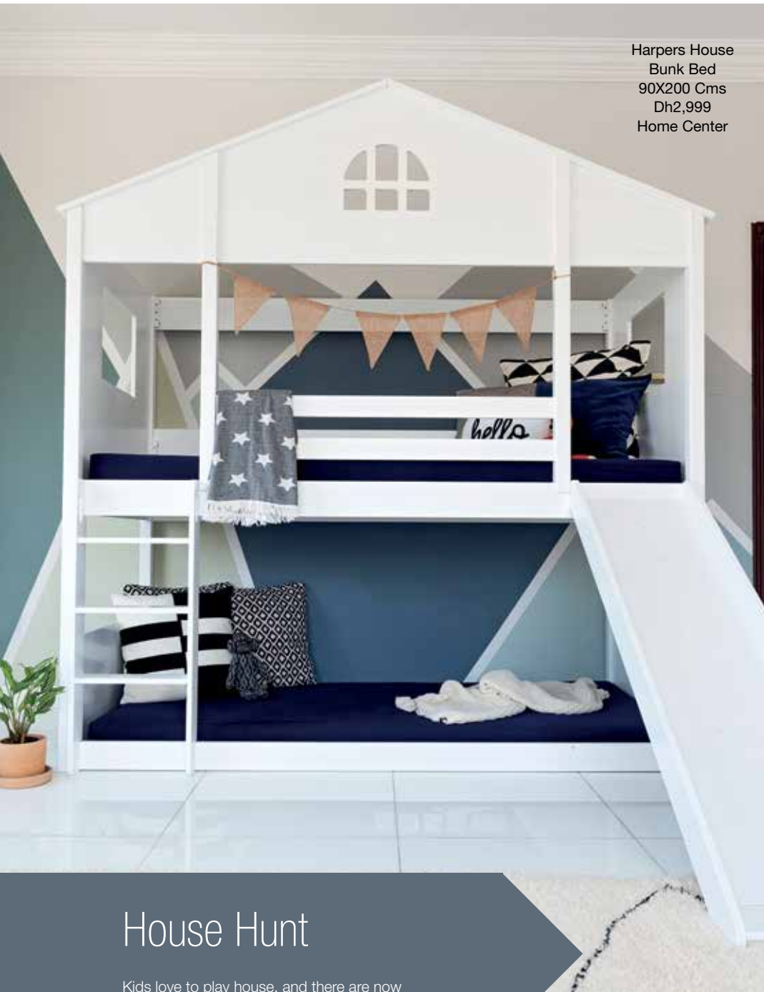
Harpers House Bunk Bed 90X200 Cms Dh2,999 Home Center