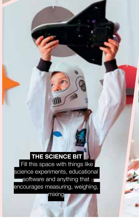
THE SCIENCE BIT Fill this space with things like science experiments, educational software and anything that encourages measuring, weighing, mixing