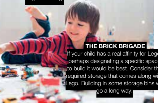
THE BRICK BRIGADE If your child has a real affinity for Lego, perhaps designating a specific space to build it would be best. Consider the required storage that comes along with Lego. Building in some storage bins will go a long way.