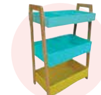
PRACTICALLY PRETTY Donni's storage shelf, Dh299, Home Centre