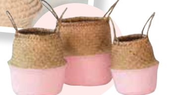
BASKET CASE Sea grass belly basket, Dh65, White Moss