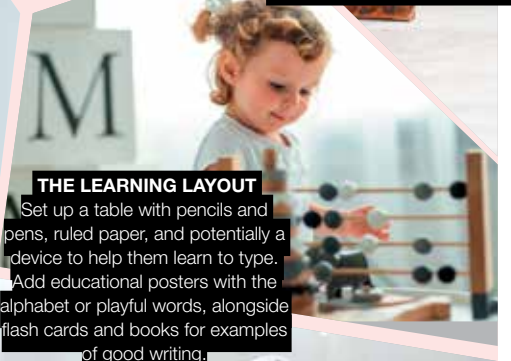
THE LEARNING LAYOUT Set up a table with pencils and pens, ruled paper, and potentially a device to help them learn to type. Add educational posters with the alphabet or playful words, alongside flash cards and books for examples of good writing.