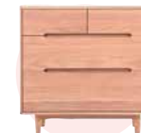
THE BIG ONE Nobodnoz dresser Pure, Dh5,660, Just Kidding