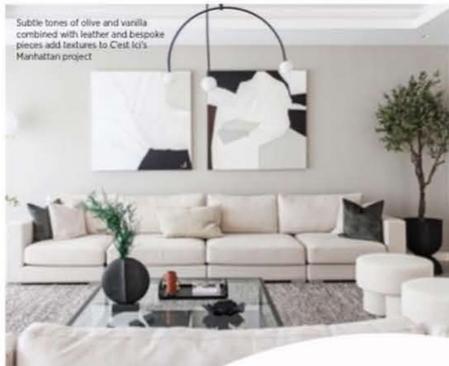
Subtle tones of olive and vanilla combined with leather and bespoke pieces add textures to C'est Ici's Manhattan project