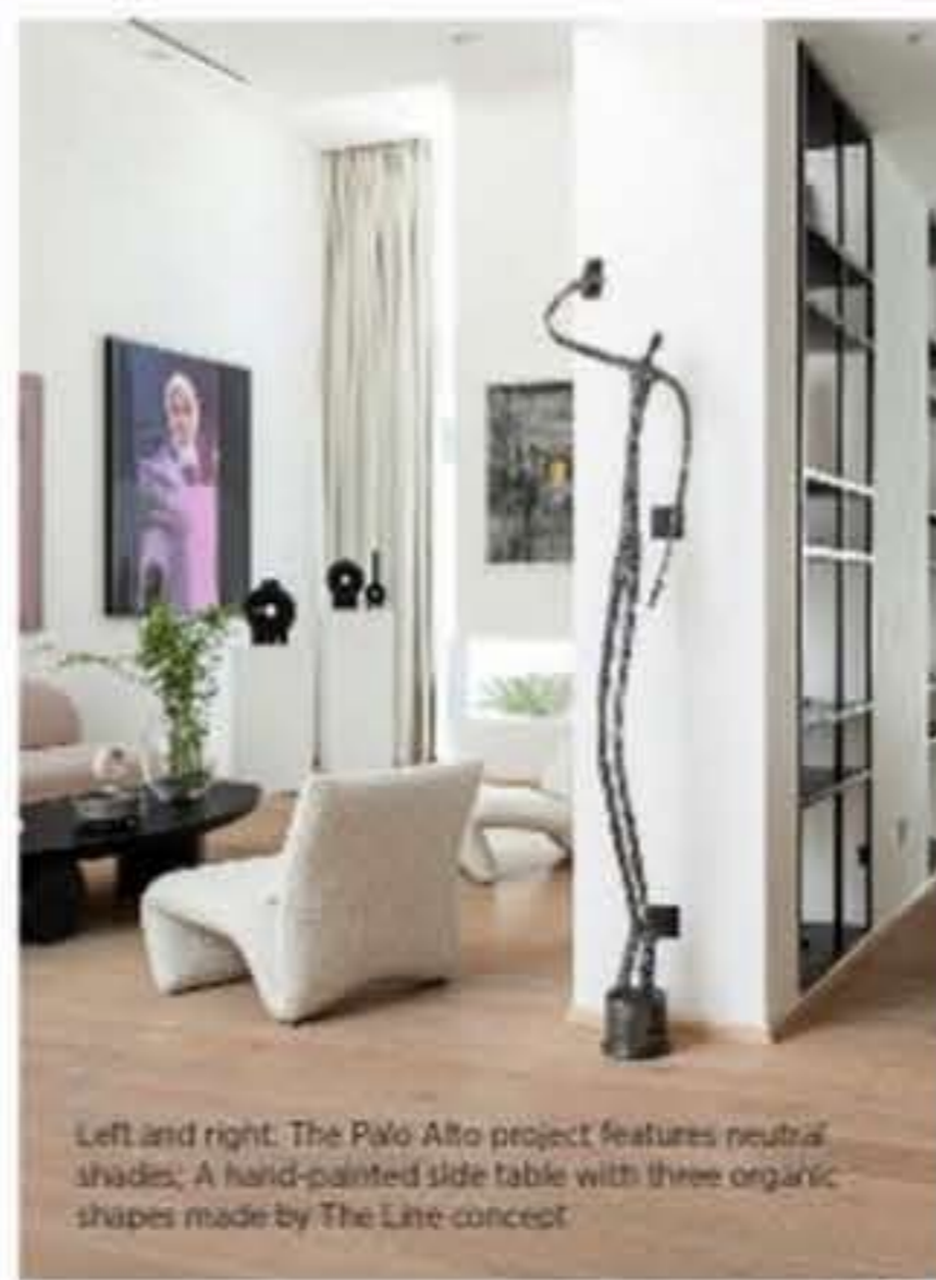
Left and right: The Palo Alto project features neutral shades. A hand-painted side table with three organic shapes made by The Line Concept