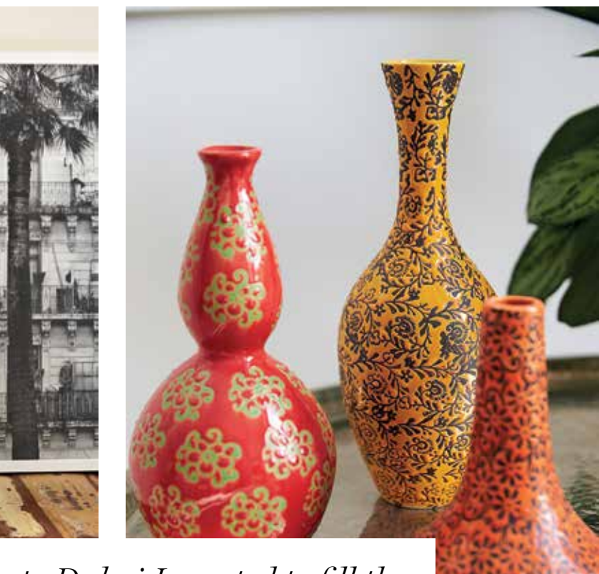
'When I came to Dubai I wanted to fill the house with things that had a story behind them, memories from Colombia and our trips around the world'