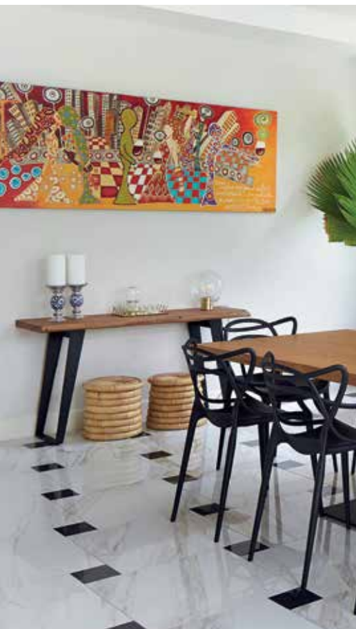
Clockwise from top Yorkshire terrier Theo is at home in the kitchen. The vaulted staircase features a stunning crystal pendant light and artwork gifted from friends. An amusing painting by Chilean artist Renate hangs above a console table from Crate and Barrel, which complements the black Kartell dining chairs and oak table.