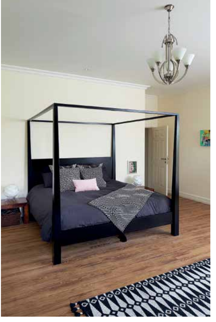
\ensuremath{\text{Left}} and top Sara's Crosley vinyl player is a retro touch while the cute ladder from Tribe Dubai displays some of her keepsakes. Her bedroom is pretty in pink and turquoise, which brightens the white furniture from Crate and Barrel and Pottery Barn. Above The master bedroom has a contemporary monochrome palette, while the wood floor adds warmth.