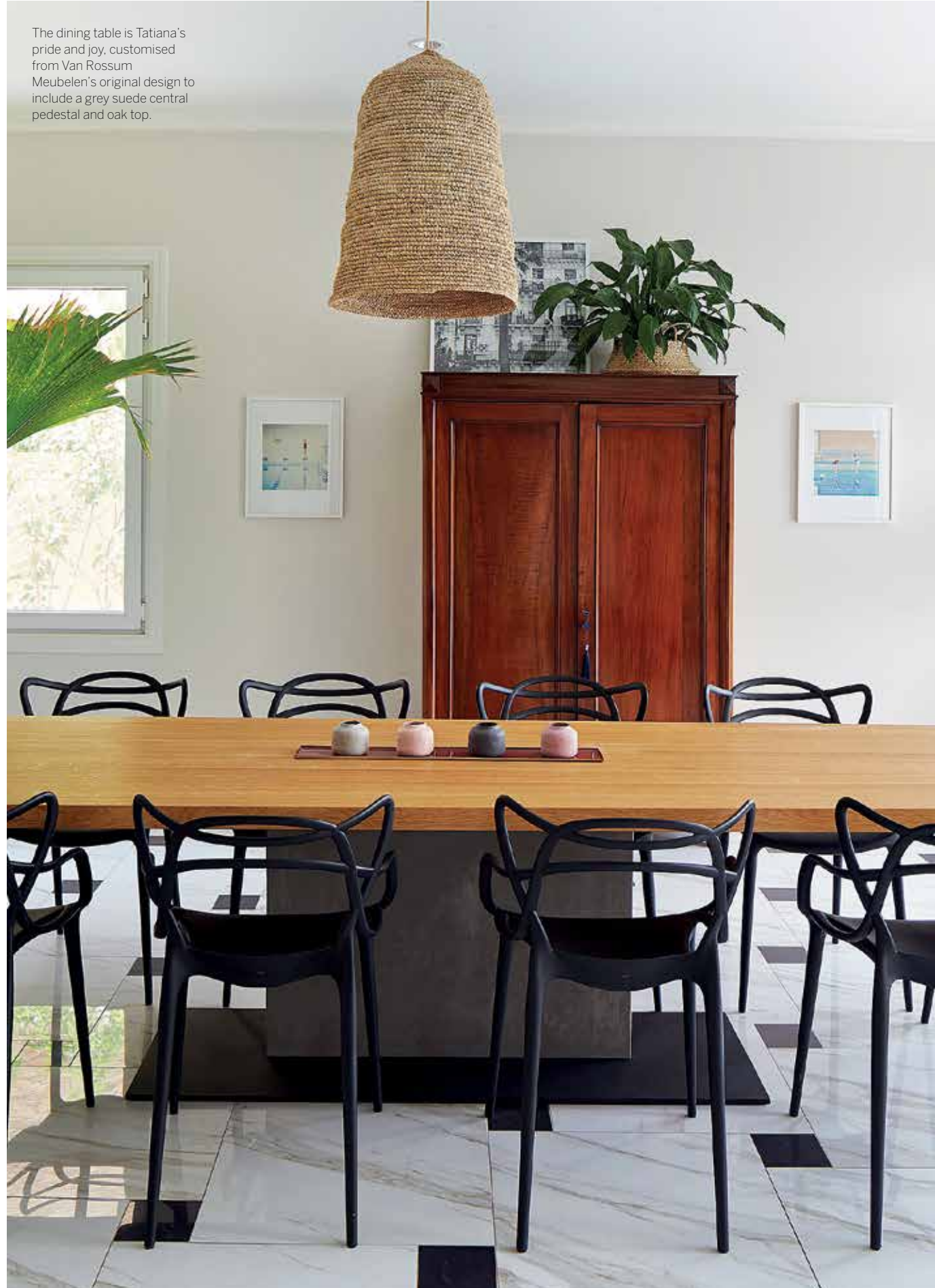
The dining table is Tatiana's pride and joy, customised from Van Rossum Meubelen's original design to include a grey suede central pedestal and oak top.