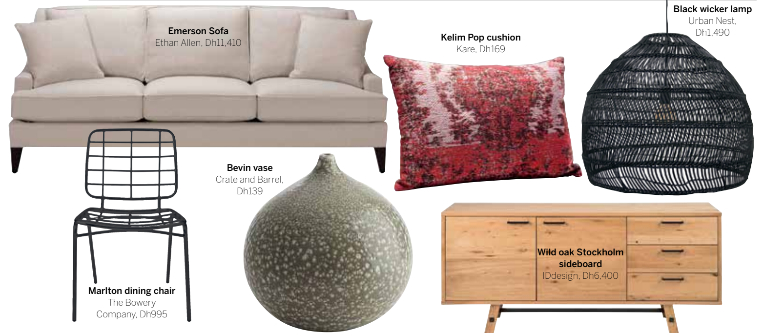
Emerson Sofa Ethan Allen, Dh11,410