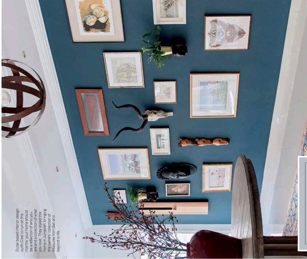
Dubai-based interior design outfit C'est ici run on the mantra 'your home should be a reflection of who you are and a collection of what you love'. They styled this home in a reinvented, bringing the character of treasures from Bali and beyond to life.