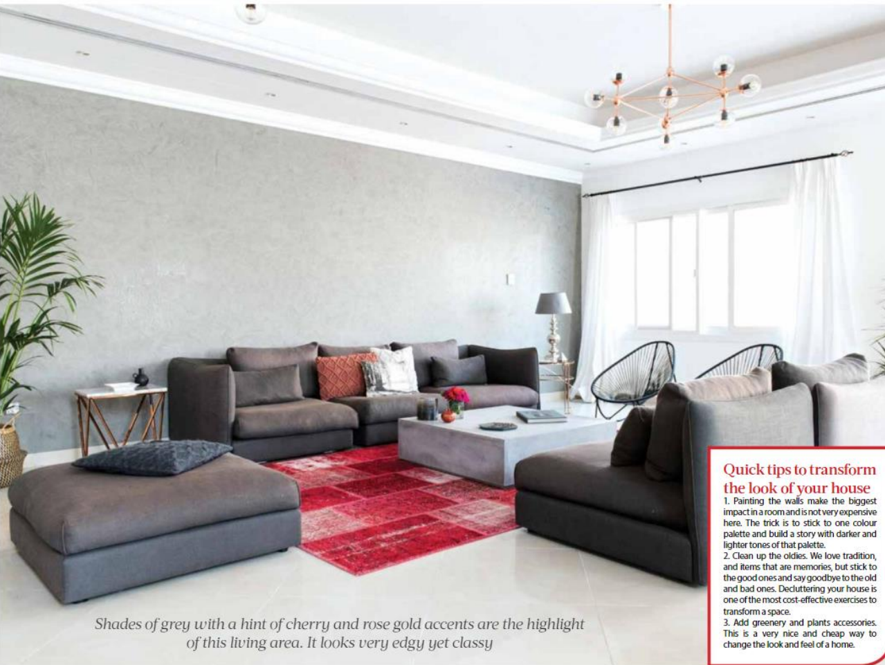
Shades of grey with a hint of cherry and rose gold accents are the highlight of this living area. It looks very edgy yet classy

Quick tips to transform the look of your house 1. Painting the walls make the biggest impact in a room and is not very expensive here. The trick is to stick to one colour palette and build a story with darker and lighter tones of that palette. 2. Clean up the oldies. We love tradition, and items that are memories, but stick to the good ones and say goodbye to the old and bad ones. Decluttering your house is one of the most cost-effective exercises to transform a space. 3. Add greenery and plants accessories. This is a very nice and cheap way to change the look and feel of a home.