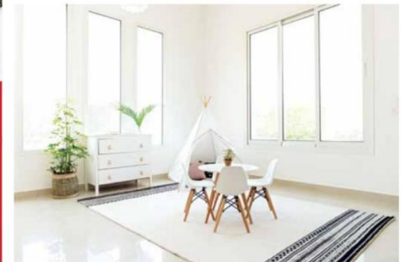
Dusty rose with a hint of black and golden accents give a contemporary look to the play area