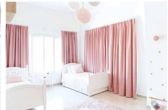
The girls room looks adorable with pink curtains and snowy white beds. There's room for ample sunlight through big windows

Quick tips to transform the look of your house 1. Painting the walls make the biggest impact in a room and is not very expensive here. The trick is to stick to one colour palette and build a story with darker and lighter tones of that palette. 2. Clean up the oldies. We love tradition, and items that are memories, but stick to the good ones and say goodbye to the old and bad ones. Decluttering your house is one of the most cost-effective exercises to transform a space. 3. Add greenery and plants accessories. This is a very nice and cheap way to change the look and feel of a home.